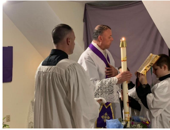
Immersion of the Paschal Candle into the Easter Water Font