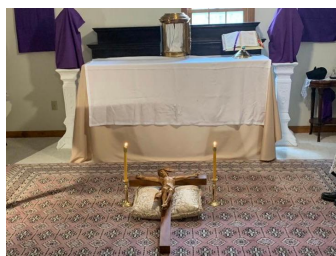
Veneration of the Cross