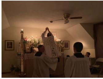
Elevation of the Host