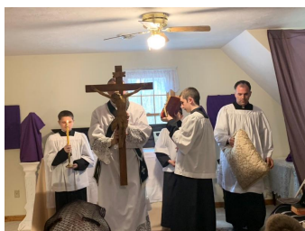
The Ecce Lignum Crucis