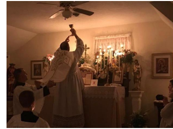
Elevation of the Chalice