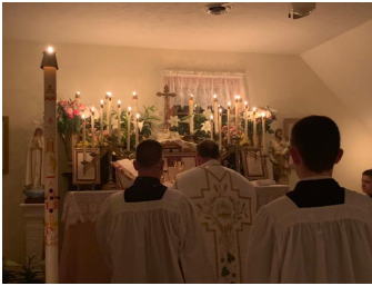
Candlelit Midnight Mass