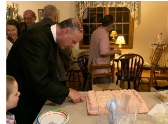
Father did the honors of cutting the cake.