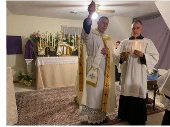
Blessing with Easter Water