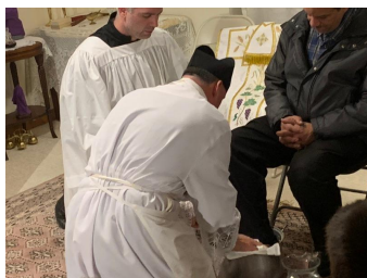
Washing of the Feet