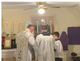
Solemn Evening Mass