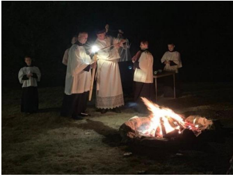
Lighting of the Paschal Candle Lumen Christi