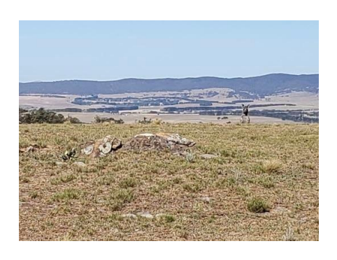
Notice anything interesting in this picture? Take a closer look -->