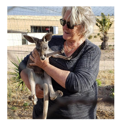
Some friendly kangaroos of Australia!