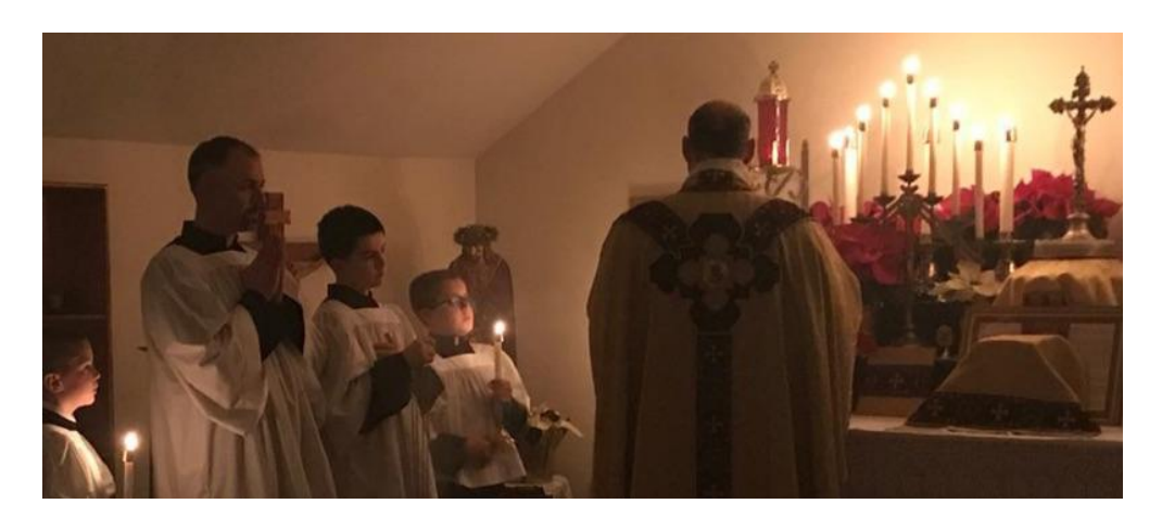
"Tidings of great joy" are chanted at the Gospel of Christmas Midnight High Mass.