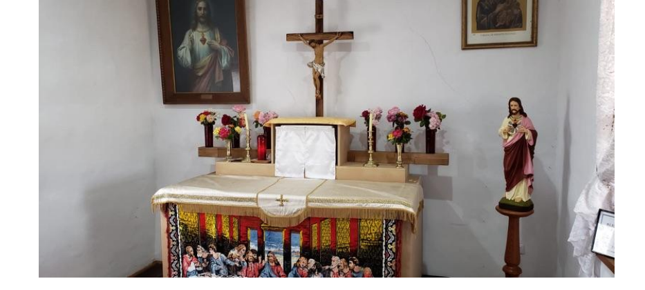
The Streaky Bay Resistance Chapel and altar where the Blessed Sacrament is kept!