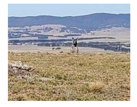
At the edge of the hill, a kangaroo curiously pops up to see what all the commotion is about!