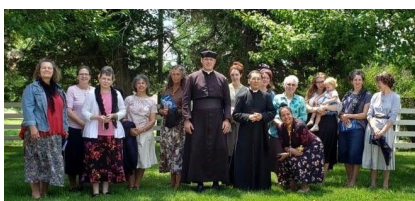
Women's Retreat: June 29th - July 4th