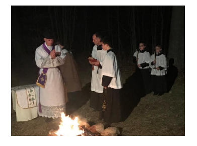
Blessing of the Easter Fire during the Easter Vigil.