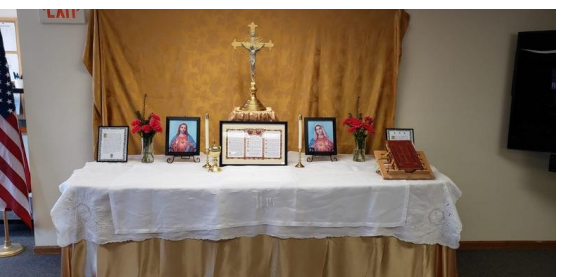
Above, lovely 'makeshift' altars for the Ambulance Hall in the Sparta, NJ area. Below, the basement Chapel Altar at the Tannersville, PA chapel.