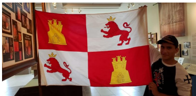
Flag of Catholic Spain

Blessing the Spanish and Indians during the Benediction of the Most Blessed Sacrament.