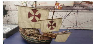
Replica of Spanish ships