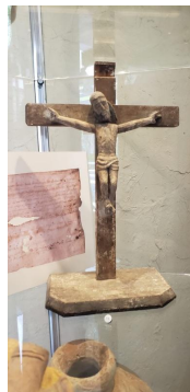
Crucifix and belongings of Juan Ponce de Leon