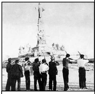
Spanish "Reds" execute the Sacred Heart..

Similar destruction happened all across Spain during those five years. On one night in 1936, for example, of the 58 churches in Barcelona, only the Cathedral was not destroyed. Not only were churches and chapels targeted: libraries, clubs, newspapers and printing presses, schools, businesses and even private homes, if they were associated with either the church or the political right, were attacked and destroyed and their owners killed. The church property destroyed was not only a loss to the clergy; it often meant the destruction of centuries of cultural capital, a heritage belonging to all of Spain, and most of all to the common people, the very ones whom the screaming rabble and their political masters claimed to represent: