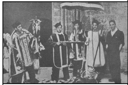
Republican desecration of Spain's churches like the 'antifa' of our own age, these agitators seem to be little more than naïve student types...