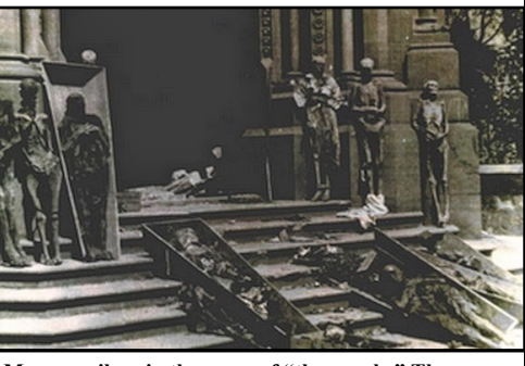
More sacrilege in the name of "the people." The graves of priests and nuns, desecrated and left on display for public mockery - scenes like this were all too common.

civil war broke out, my uncle was taken from his home and shot." (p.109 ff.)