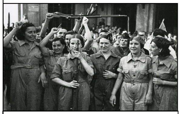
1936: some forerunners of our own empowered feminists... Only one side in the Spanish Civil War had women soldiers - they lost.

There are just too many lurid details to quote them all at length here; I am sure there will be other accounts written by other men, enough to fil volumes. These details are simply what one man observed happening in his own country. They show exactly how the situation deteriorated in those few years and paint a vivid picture of how a country can tear itself apart once its government is subverted, justice is turned on its head, the good men have their hands tied and are kept down by the same powerful political figures who are busy giving the wink and nod to criminality, and "spontaneous" mobs are organised and funded for that purpose.