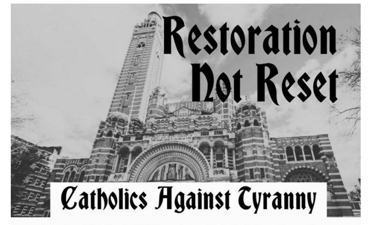
Saturday, 29th May 2021 | Westminster Cathedral, Front Piazza, 12pm

The Catholic of England marched in London, praying the Rosary for the Restoration of the Social Kingship of Christ, not the 'great Reset' of Satan! A real solution to the problem of the 'Great Reset!"