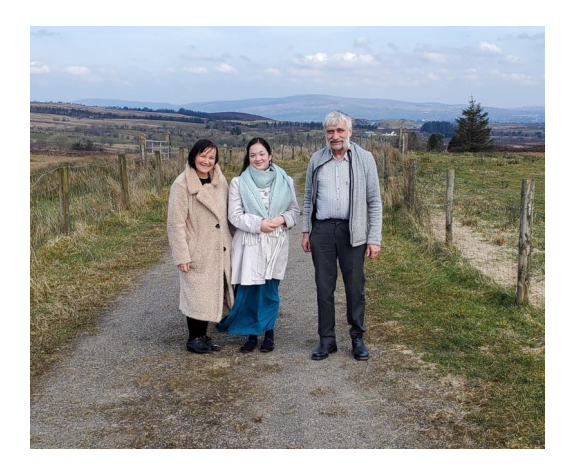
A few of the local Irish faithful on their way to one of Ireland's many Mass Rocks nearby.

The Protestant authorities during the late 1600's and early 1700's passed the degrading Penal Laws (see The Recusant Issue #55 for a partial list) which heavily persecuted the Catholics of England and Ireland. Despite Catholic chapels having been appropriated by the Protestant authorities, Holy Mass continued to be celebrated in secret at a number of locations including barns, out-buildings and