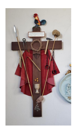
The instruments of the Passion adorn the walls of Albrecht's chapel.