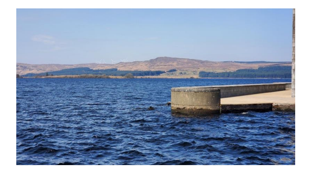
A view of St. Davog's Monastery on the other side of the lake as one approaches St. Patrick's Purgatory.

There is a firmly established tradition regarding St. Dabheog, who presided over, and possibly established, the monastery on the site during the lifetime of Patrick.