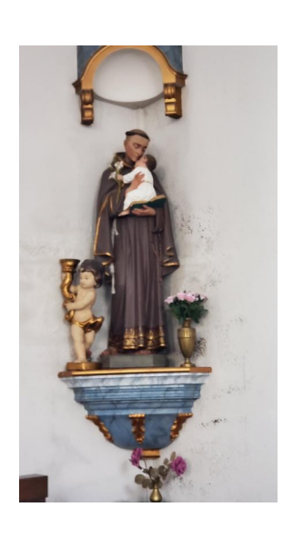
St. Anthony of Padua graces the chapel.