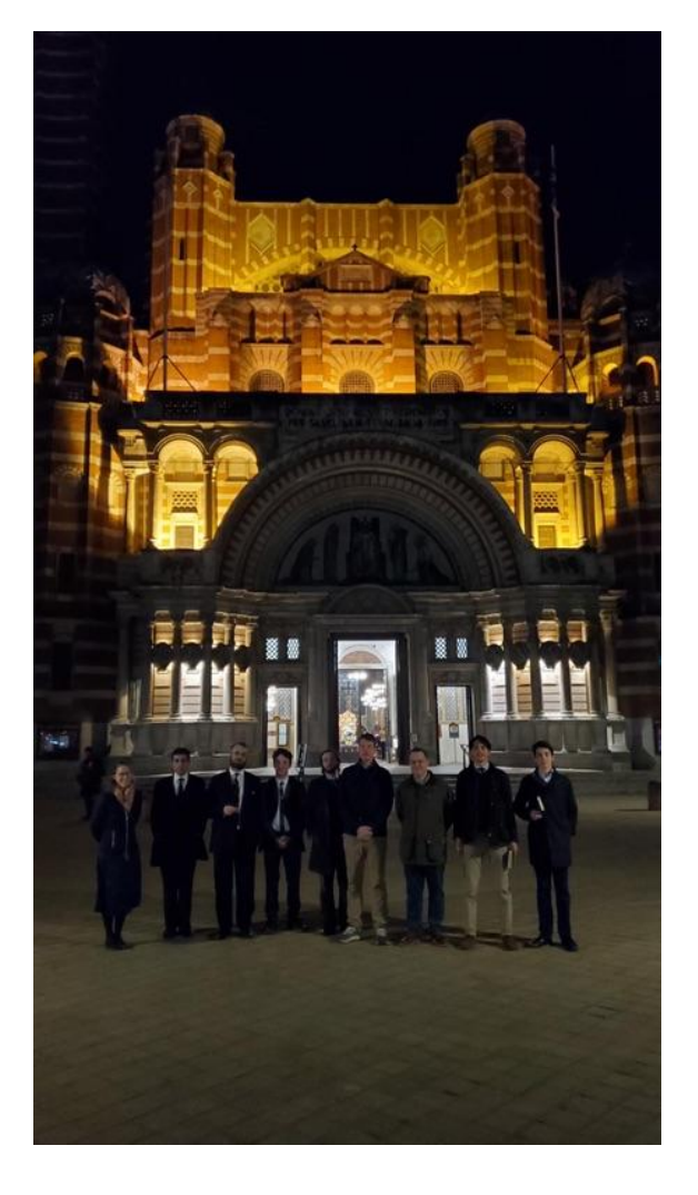
Some members of the League of the Sons of St. Philip Neri in front of the illuminated Westminster Cathedral at night, where they often gather to pray and make reparation!