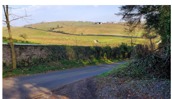
The Irish countryside!