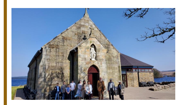
St. Mary of the Angels Chapel, built in 1763, is the first of the 'modern' churches built on the Island.