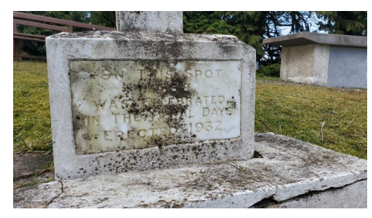
The inscription reads, "On this spot Mass was celebrated in the Penal Days. Erected 1932."