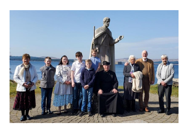
A visit to St. Patrick's Purgatory at Lough Derg, County Donegal, Ireland!