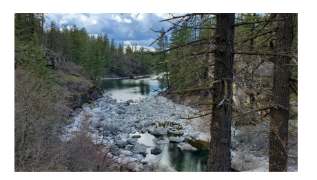
One of the many lakes and rivers around Post Falls, Idaho.