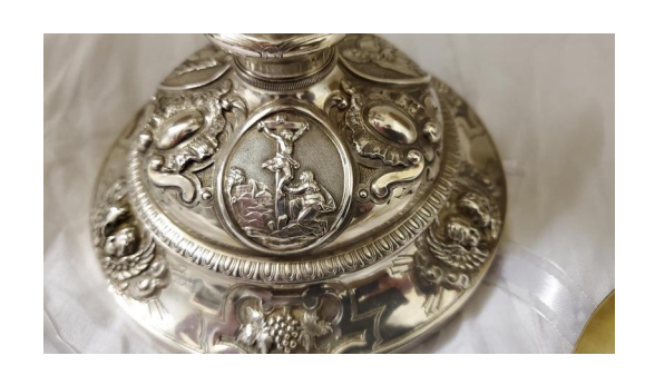
A 17th century chalice with intricately hand-carved images, including this one of the Crucifixion.