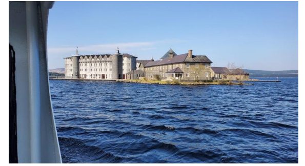
A view of the Island as one approaches from the St. Davog ferry.