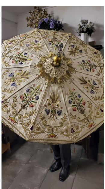
Exquisitely hand embroidered by nuns, these priestly vestments and umbellina , which is used to shelter the Blessed Sacrament during Processions, were rescued by Albrecht when all was being arrogantly discarded during the 'iconoclasm' following Vatican II.